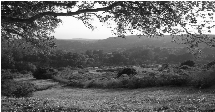
Coast Dairies has been beckoning since 1998.